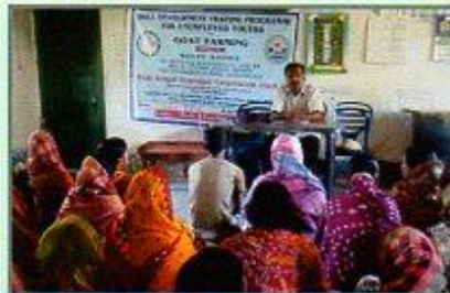
Trainees in Goat Farming