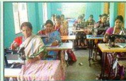
Training in Tailoring Course (SHG & SE)