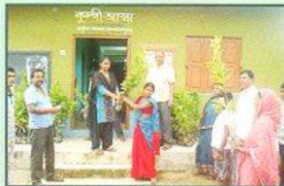
Shuli Industrial Officer Kulpi Block distributing plants