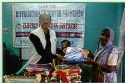
Winter Garments to Hapless Villagers