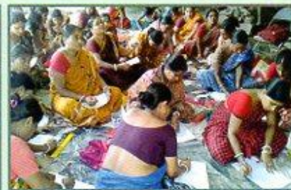
Participants in Awareness Camp