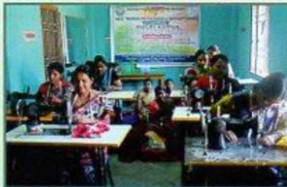
Training in Tailoring Course (W.B.S.R.C.L)