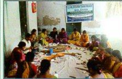
Trainees in Shola Pith