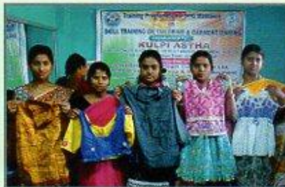
Trainees with their finished products (Tailoring)