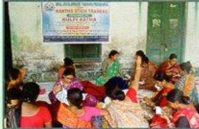
Trainees in Kantha Stitch